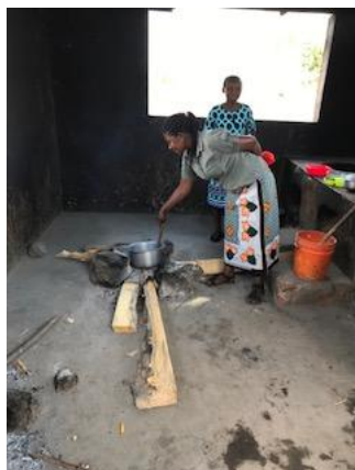
Main cook house – using wood