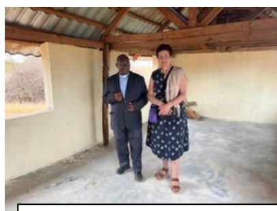
Inside reception room