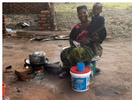
Cooking outside Elizabeth's house using charcoal