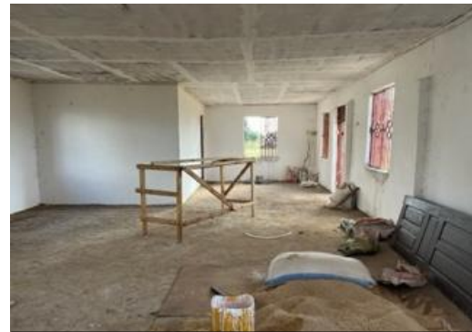
Inside the 'almost complete' girls' dorm

L to R – Boys Dorm, 2 x classrooms, Girls' dorm