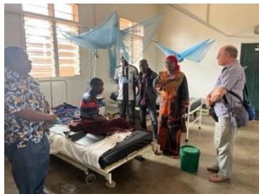
Patient and relatives