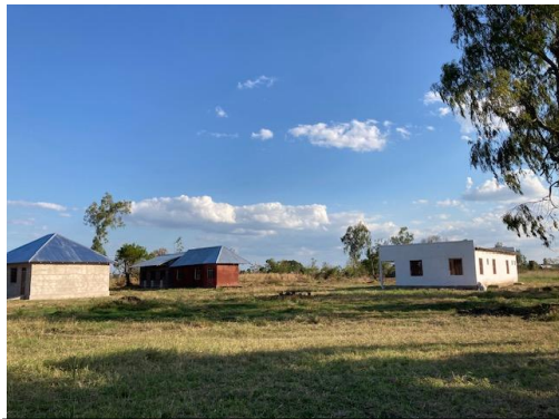
Secondary School Buildings

L to R – Boys Dorm, 2 x classrooms, Girls' dorm