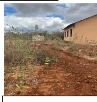
Children's toilets behind hall