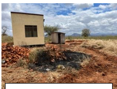
Staff Toilets behind staff house