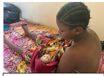
Two-day old baby delivered by C-section